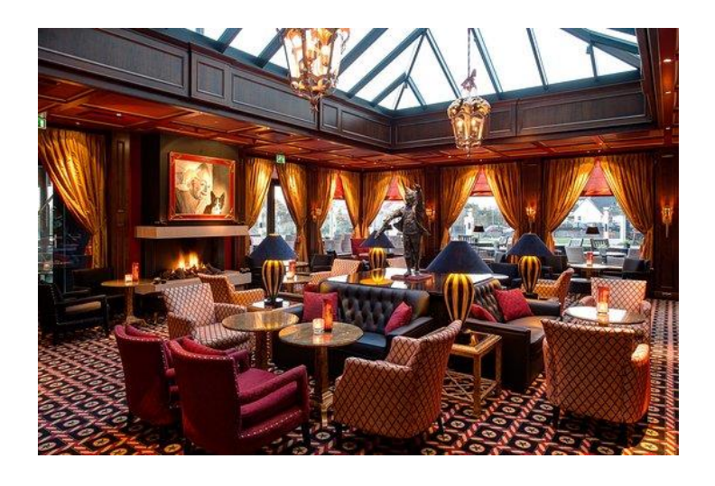
Join us next year by the beach at Noordwijk