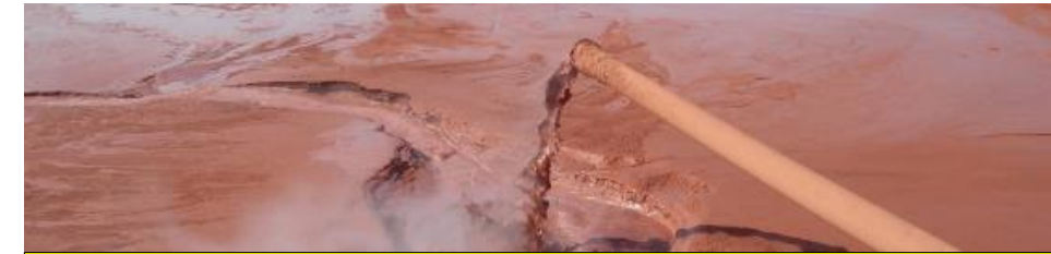
Red mud from bauxite processing subject to much R&D in recycling